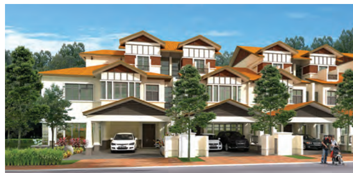
Ukiran (Type C) Land Area: 1,916 sq. ft. - 5,877 sq. ft. Built-up Area: 3,546 sq. ft. - 5,010 sq. ft. Selling Price: RM694,888 - RM1,208,888 Discount: 7% for Bumiputra