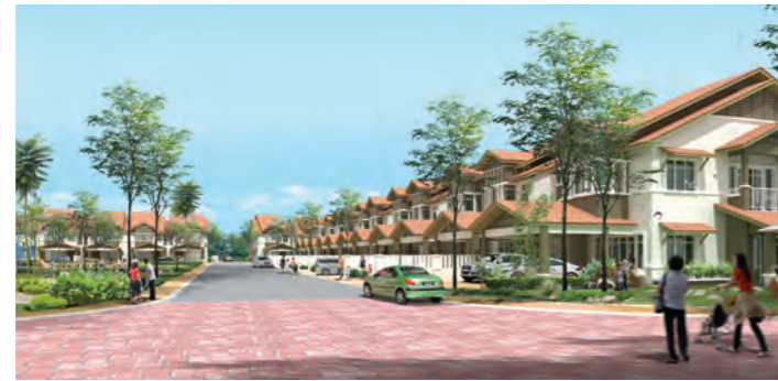
Ukiran (Type B) Land Area: 1,916 sq. ft. - 6,082 sq. ft. Built-up Area: 2,935 sq. ft. - 4,288 sq. ft. Selling Price: RM578,888 - RM1,091,888 Discount: 7% for Bumiputra