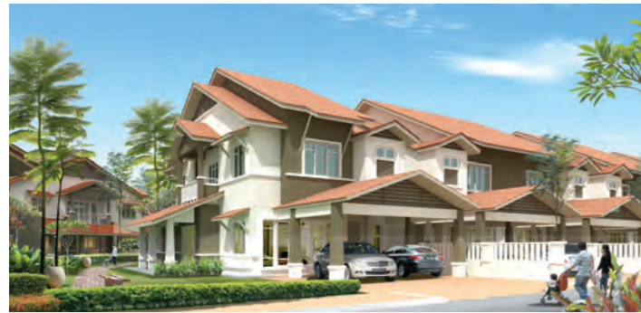
Ukiran (Type A) Land Area: 1,916 sq. ft. - 5,554 sq. ft. Built-up Area: 2,924 sq. ft. - 3,429 sq. ft. Selling Price: RM579,888 - RM926,888 Discount: 7% for Bumiputra

If it's space you're looking for, then we have it, in Ukiran, our 2 & 3 storey linked home. With 11 different types to choose from, you can experience 11 types of spacious homes. Now you can kick back and relax in a roomier interior.