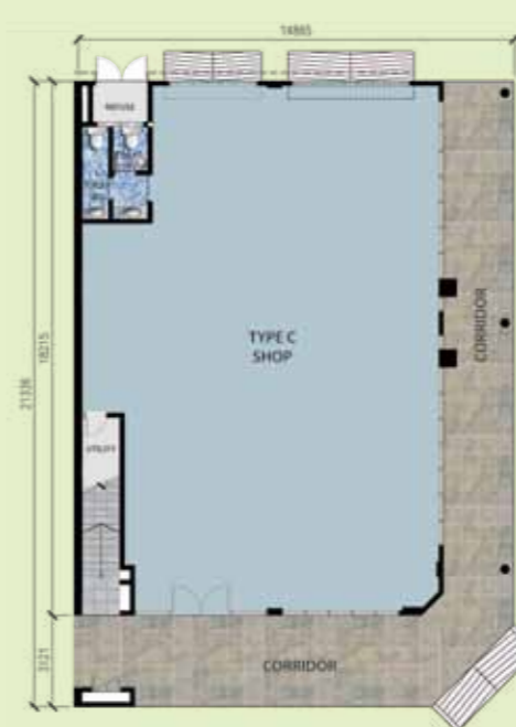
CORNER TYPE C GROUND FLOOR