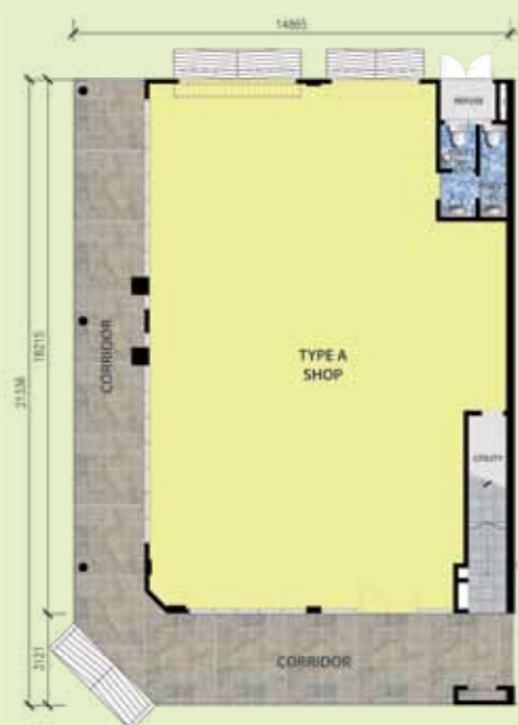
CORNER TYPE A GROUND FLOOR