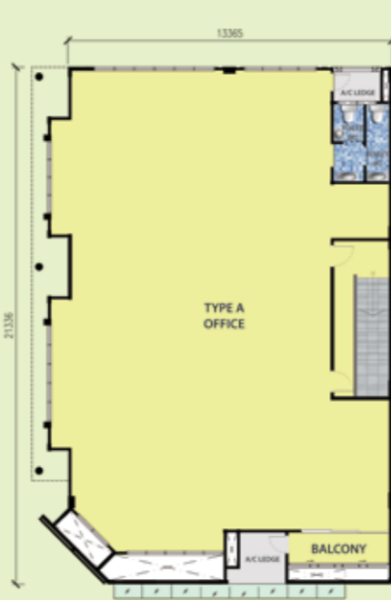
CORNER TYPE A FIRST FLOOR