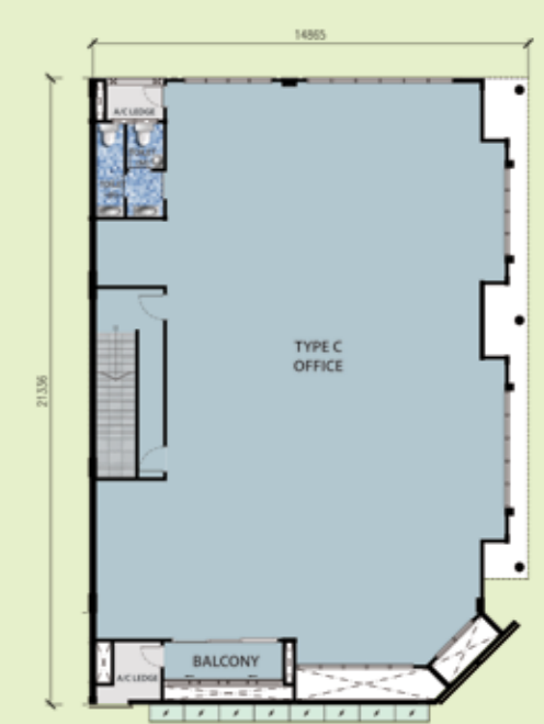
CORNER TYPE C FIRST FLOOR